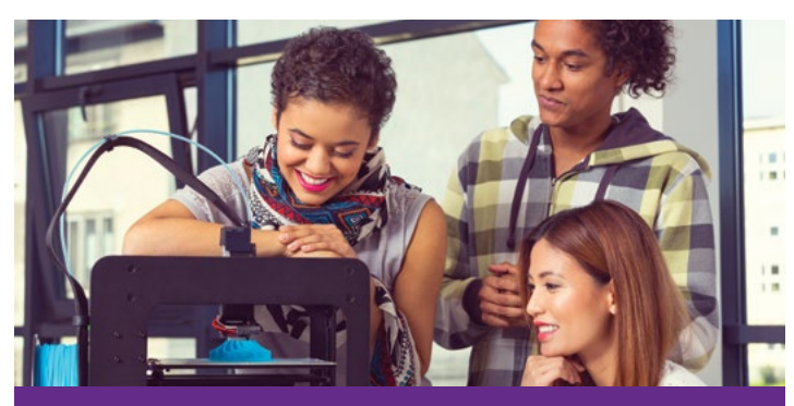
STUDENTS WHO ENJOY working with advanced technologies

Ever had an idea and wondered how you could make it a reality? Manufacturing is your answer. People in manufacturing work together to transform ideas into products, and today's entrepreneurs and dreamers are using unique methods and new technologies to produce their products.