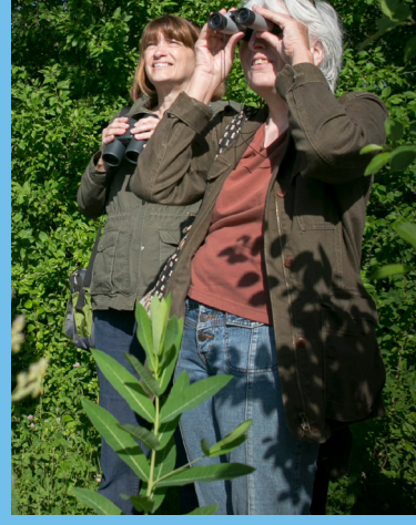
Learn about Cook County wildlife and go birdwatching on your own or on an organized bird walk.