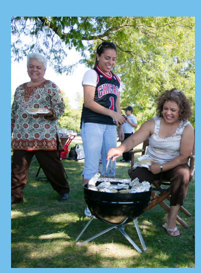
Enjoy time outdoors with friends, family and loved ones at one of more than 300 picnic groves.