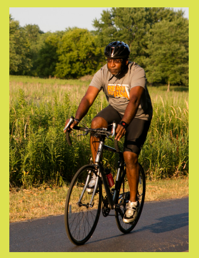
Hike, bike or run along more than 300 miles of paved and unpaved trails.