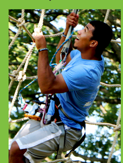
Enjoy the thrill of Tarzan swings and zip lines at the Go Ape Treetop Adventure Course at Bemis Woods.

Having fun and spending time in nature are one and the same. Whether you are looking for a family-friendly activity or are an outdoor adventure seeker, there are many ways to enjoy and play in the Forest Preserves of Cook County.