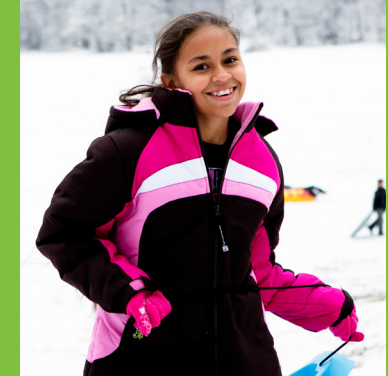
Beat the winter blues and have fun in the snow by visiting one of our many sledding hills.