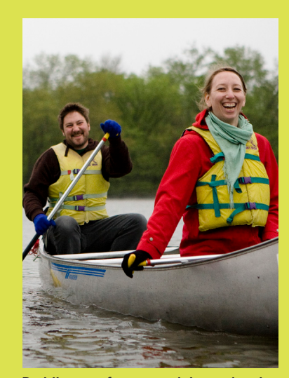
Paddle one of our many lakes or local waterways. Rent a canoe or kayak or use your own.