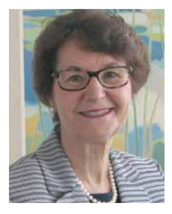
Message from the President of Three Rivers Community College