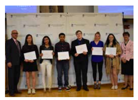
Liberty Bank Scholarship - Scholarship recipients