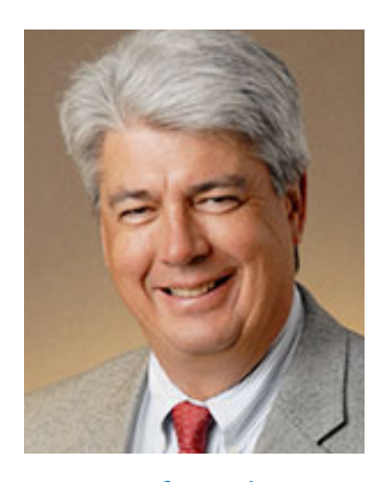
Message from the President of Three Rivers College Foundation

Each time the Three Rivers Foundation Board of Directors meets, we are awed by the generosity of you – our donors. Year after year, you give generously to help students in our community on their educational journey.