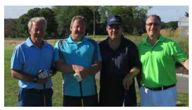
Team Dime Bank