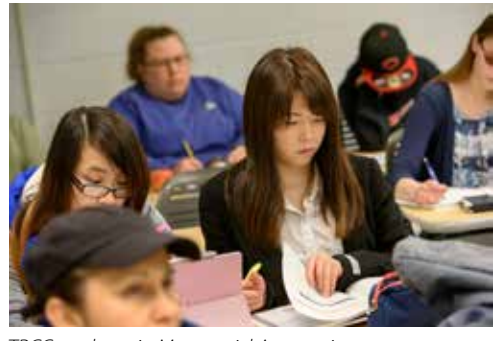
TRCC students in Managerial Accounting

"Through scholarships and special funding, the TRC Foundation works with the College to meet the needs of our students. It is our responsibility as a good citizen to give back to the local community. When you give to the TRC Foundation, you make a difference in the lives of the students, you are making a difference in the local community, and that is a great feeling."