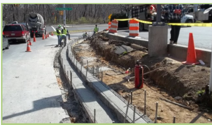
New concrete is poured into forms

Thank you for your cooperation as we work to improve the county infrastructure for residents and users!