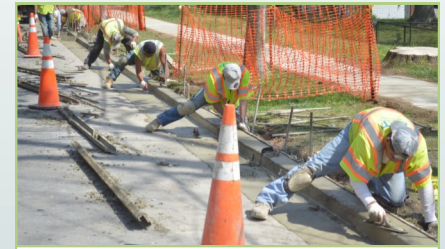
Concrete is smoothed and finished

This project may necessitate temporary lane closures and temporary parking restrictions.