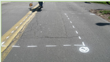
Typical survey paint markings

Overall, the pavement conditions of Watkins Mill Road were generally rated as fair to poor, with some areas described as needing more attention. This rating meets the criteria for Primary/Arterial Roadway Preservation using full-depth patching followed by hot mix asphalt (HMA) overlay.