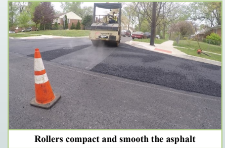
Rollers compact and smooth the asphalt

The project is expected to begin in May of 2018 and will take 6-8 weeks to complete, weather permitting. Construction will be performed during the day between 9 am and 5 pm, Monday through Friday.