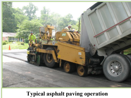
Typical asphalt paving operation