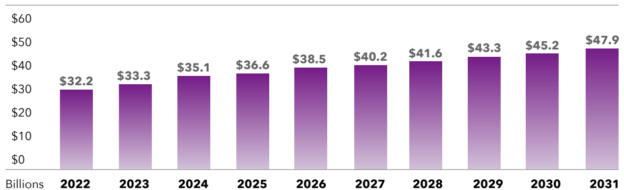
FIGURE 2. DEFICIT EFFECTS OF MEDICARE AT 60

Over time, the impact on the federal budget from Medicare at 60 would grow. As shown in figure 3, federal deficits would rise by $47.9 billion in 2031. In total, 10-year federal deficits would rise by $393.9 billion. The impact on Medicare spending would be even larger. Total Medicare spending would rise by $995 billion over 10 years.