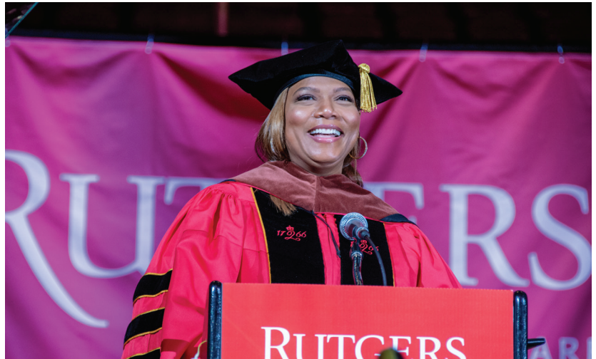
Queen Latifah, the hip-hop icon, award-winning actress, singer-songwriter, and producer, gave the keynote address to a full house at the Rutgers University-Newark commencement ceremony on May 14 at the Prudential Center.