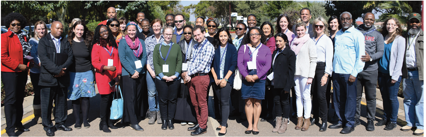
Rutgers-Newark faculty and graduate students join Mamelodi faculty and administration for a planning workshop, May 29, 2018.

Rutgers University-Newark through the Graduate School has entered into an exciting partnership with the University of Pretoria's Mamelodi campus, to share best practices, build capacity and collaborate under five areas: Strong, Healthy, and Safe Neighborhoods; Educational Pathways; Science and the Urban Environment; Economic Development; and Arts and Culture.