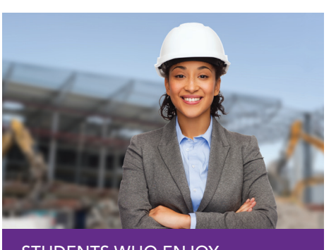
STUDENTS WHO ENJOY working outside