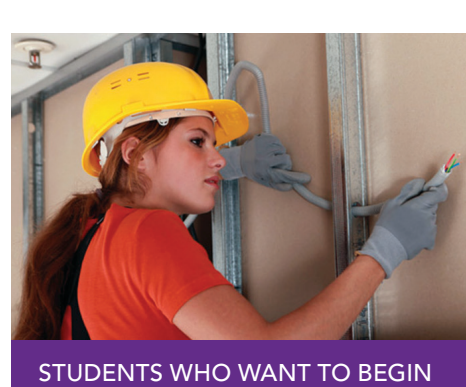
careers after high school