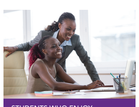
STUDENTS WHO ENJOY working on a computer