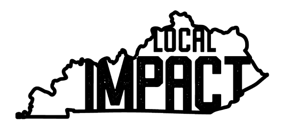
Figure 3: UK Dining KYFFBI marketing logo

Assessment of the breakdown of KYFFBI purchases by product type is summarized in Table 8. The largest category of expenditures was meat products ($730,624) with $539,973 of those expenditures having at least some farm impact. Produce purchases were down from last year at $16,622 and constituted 1% of the KYFFBI purchases.