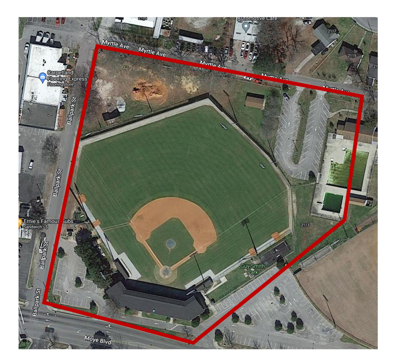
EXHIBIT A GUY SMITH STADIUM