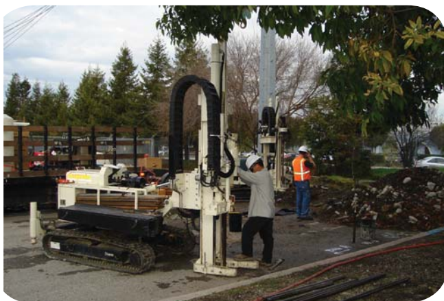
Injection of vegetable oil underground to improve conditions for bioremediation.

Bioremediation has successfully cleaned up many polluted sites and has been selected or is being used at over 100 Superfund sites across the country.