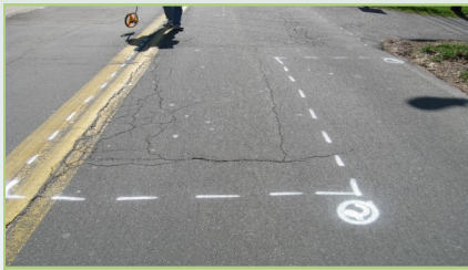
Typical survey paint markings

The Montgomery County Department of Transportation's (MCDOT) Division of Highway Services (DHS) maintains nearly 5,200 lane miles of streets and highways in the county's transportation system. As part of our County-wide pavement system preservation efforts, MCDOT initiated a new Pavement Management System in 2008. Every two years, MCDOT conducts a pavement assessment. The last survey condition inventory of all County roads was completed in 2017. This new assessment survey has enabled the development of County-wide roadway repair strategies based on a formula-based objective rating system coupled with budgetary parameters.