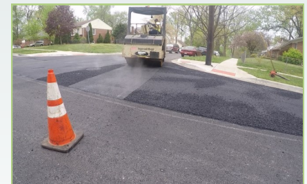
New asphalt is compacted with steel wheeled roller

Quality control for the entire project will be managed by County inspection staff to ensure that all work project meets County specifications.