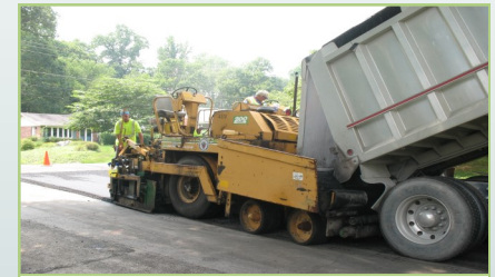
Typical hot mix asphalt paving operation

6. Replace roadway lane markings - Permanent lane markings, if existing prior to paving, will be remarked shortly after all paving operations have been completed.