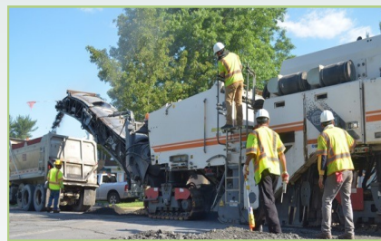
Typical milling operation

5. Paving with hot mix asphalt - Asphalt is delivered to the site in dump trucks. The hot material is transferred into the hopper of an asphalt paving machine such as the one depicted in the photo. The paving machine places the hot asphalt in a uniform thickness and provides initial compaction.