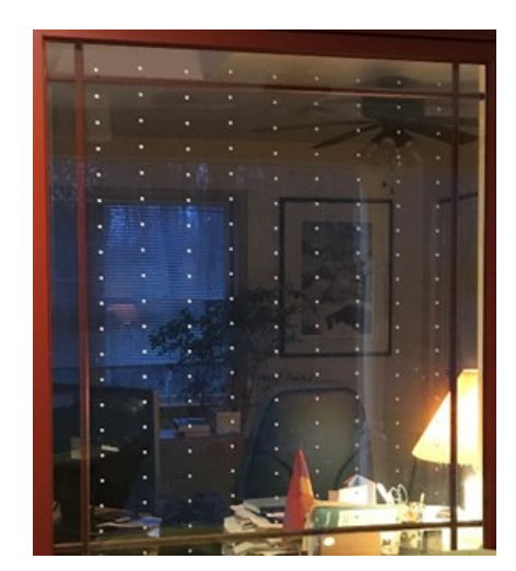
Feather Friendly® Do-it-yourself Tape