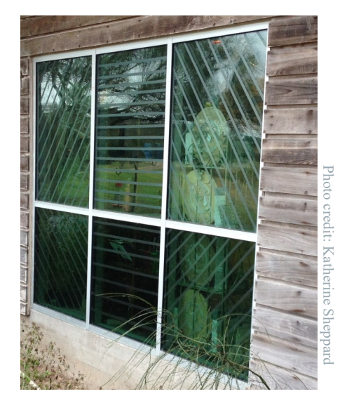
American Bird Conservancy Bird Tape

Less can be more! Smaller markers can be effective and block less of your view.