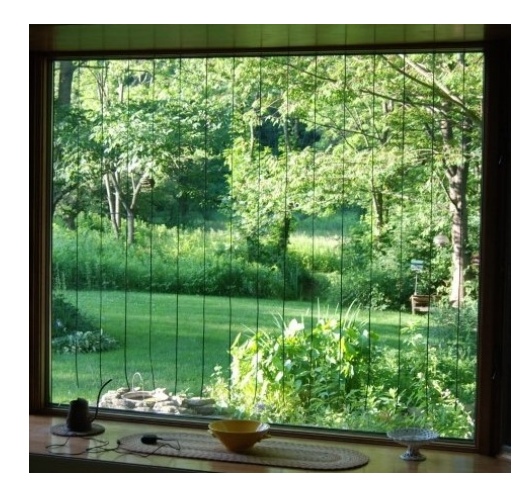
Visit the Acopian BirdSavers website for plans or to order them custom made for your windows.

Hanging cords, strings, or ribbons in front (outside) of your windows on 4" centers can be effective and unobtrusive. Simple and easy to do yourself.